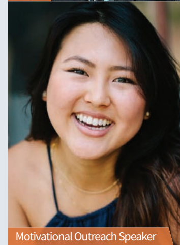
Motivational Outreach Speaker